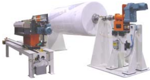
PARENT REEL APPLICATIONS