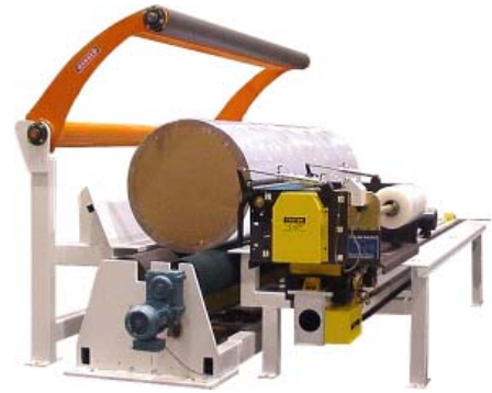
NONWOVEN & TECHNICAL FABRICS APPLICATIONS