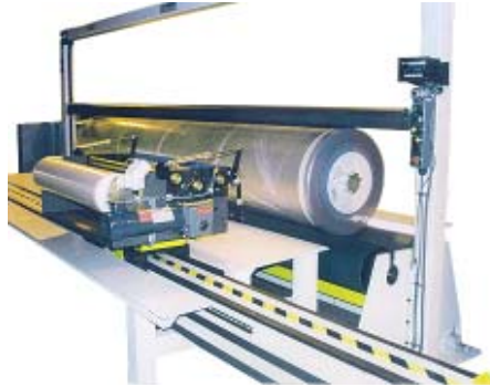
CARPET & TEXTILE APPLICATIONS