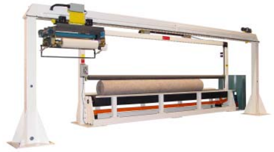
CARPET AND TEXTILE APPLICATIONS