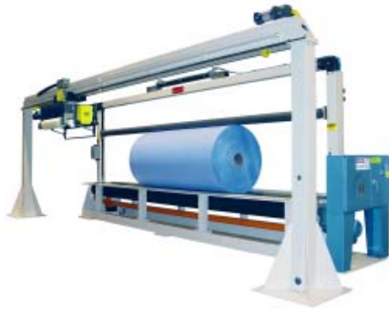
NONWOVEN AND TECHNICAL FABRICS APPLICATIONS