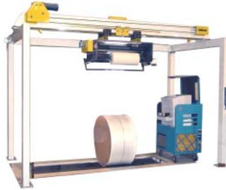
PULP & PAPER AND CONVERTER APPLICATIONS